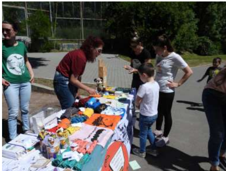
Natura 2000 Day at Sofia Zoo