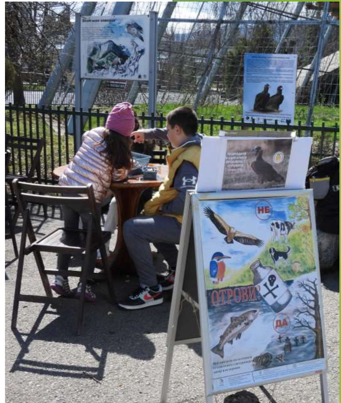
International Vulture Awareness Day