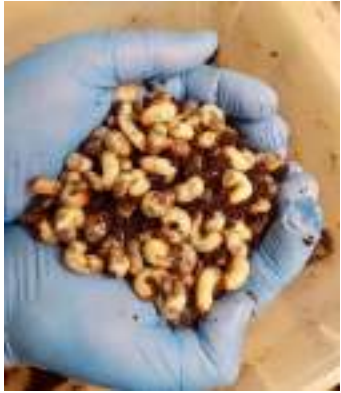
Breeding and release of larvae